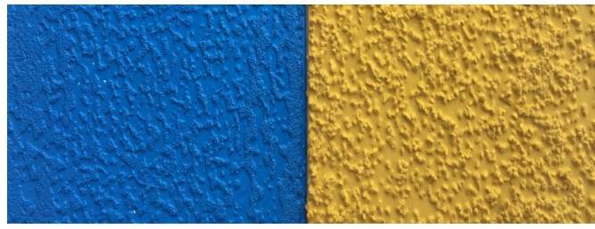
MC-TruGrip Micro 100

Another Wasser solution designed for protecting traffic areas in demanding environments.